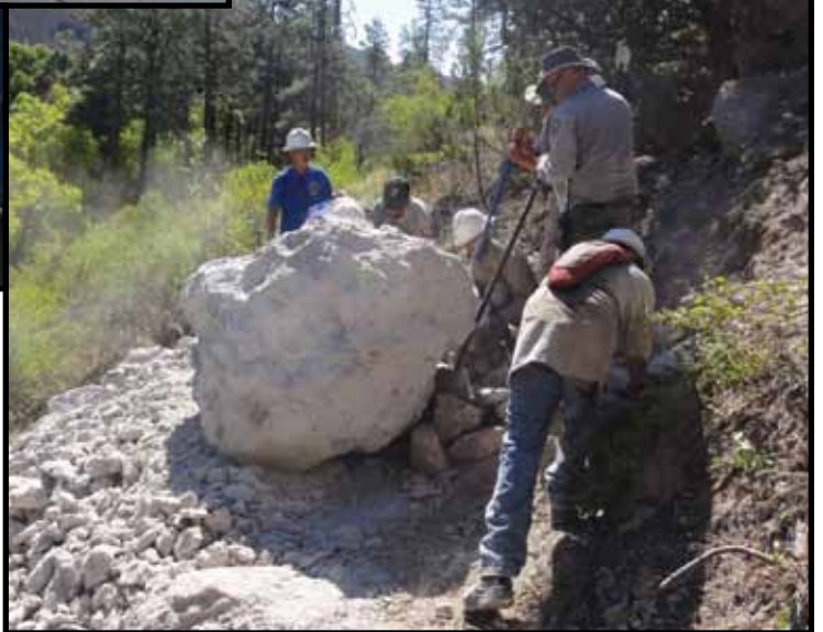
Top: Crew members pose by a fallen tree after Hurricane Sandy. Above: Crew member helps prepare sleeping areas at a Sandy relief shelter. Right: Crew members clear trails at Bandelier National Monument.

Rocky Mountain Youth Corps responded to Hurricane Sandy by sending a team of seven AmeriCorps Members to New York City to provide disaster relief assistance. RMYC Corpsmembers staffed emergency shelters throughout Brooklyn and gutted destroyed properties in the Rockaways.