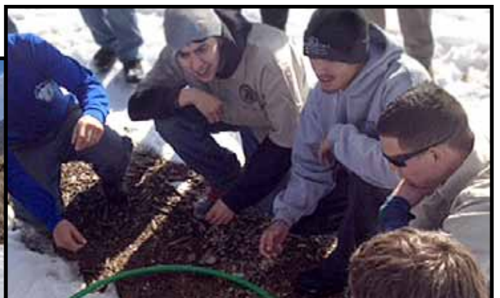
Left: Corpsmembers commence Ropes Course Orientation. Above: Corpsmembers engage in a team building exercise.

ROCKY MOUNTAIN YOUTH CORPS BOARD OF DIRECTORS